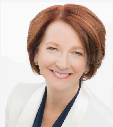
JULIA GILLARD Chair of the Board of Directors